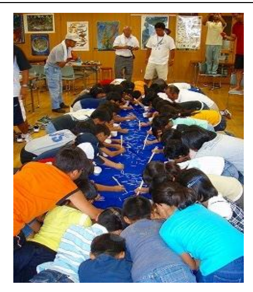
Education is not the filling of a pail, but the lighting of a fire. (by Wiliam Butler Yeats)